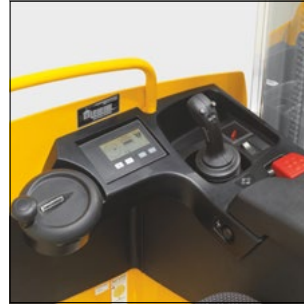
Ergonomic layout of all controls