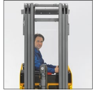
Excellent visibility through the mast