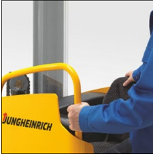
Grab handle for safe access and for the fitting of various options